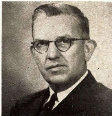
Louis E. Denfeld, Admiral, USN (ret.)

The Association is grateful for the opportunity to appear before you today in connection with the Committee's consideration of the vital subject of construction of military hospital facilities and related matters. This involves a matter of transcendent importance to our Association because of its impact on medical care for retired servicemen and their dependents.